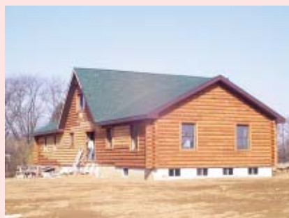
Views of the log home being re-assembled with a new foundation at Hope International.